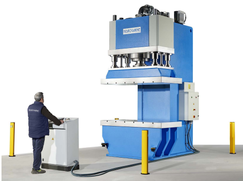
CM-400 E For straightening rails.