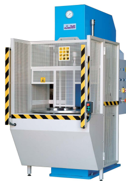
CM-100 E Indexed splitter plate with two stations