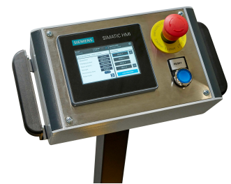
SIEMENS NC mod.MTP-400